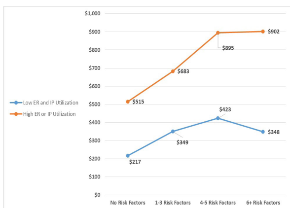
Exhibit 3: Total allowed PMPM Spending by number of addressable risk factors: comparing those with and without a history of high Emergency Room or inpatient utilization.

Source/Notes: Analysis of MHN ACO Data; Regression results available in supplemental appendix.